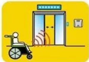
Hand free applications