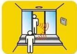
Personal ID access control