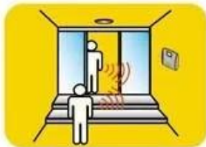
Personal ID access control