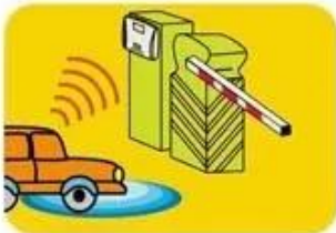
Vehicle access control system