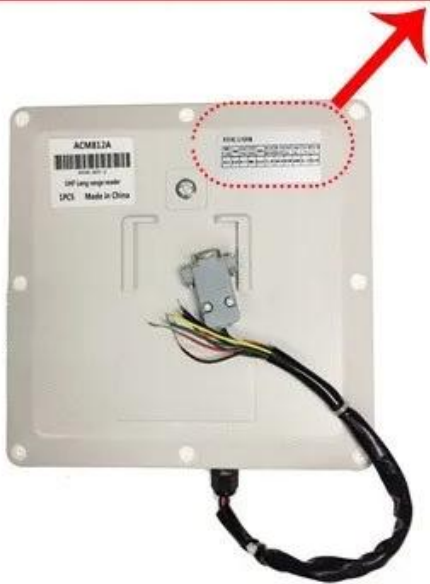
Wiring Diagram of RFID UHF reader and writer