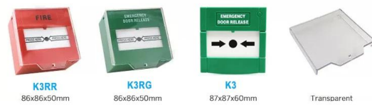
K3RR K3RG K3 Transparent 86x86x50mm 86x86x50mm 87x87x60mm