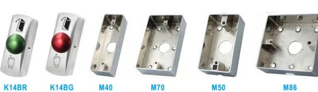
K14BR K14BG 80x30x25mm 80x30x25mm M40 M70 115x40mm 115x70mm M50 M86 86x50mm 86x86mm