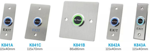
K841A K841C 115x40mm 115x70mm K841B K842A K843A 86x86mm 115x40mm 115x40mm