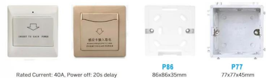
P86 P77 86x86x35mm 77x77x45mm Rated Current: 40A, Power off: 20s delay