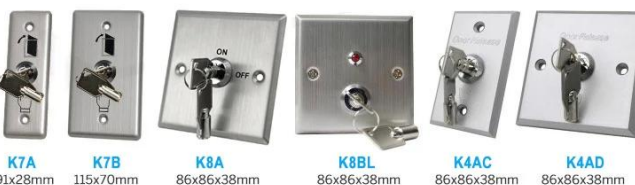
K7A K7B 91x28mm 115x70mm K8A K8BL 86x86x38mm 86x86x38mm K4AC K4AD 86x86x38mm 86x86x38mm