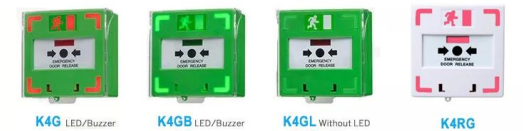
K4G K4GB K4GL K4RG LED/Buzzer Red LED/Buzzer Green Without LED 90x93x45mm