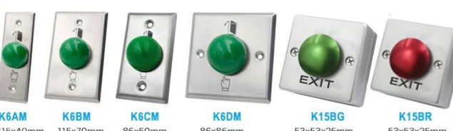
K6AM K6BM 115x40mm 115x70mm K6CM K6DM 86x50mm 86x86mm K15BG K15BR 53x53x25mm 53x53x25mm