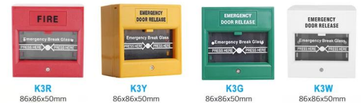
K3R K3Y K3G K3W 86x86x50mm 86x86x50mm 86x86x50mm 86x86x50mm