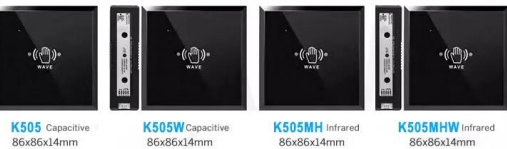
K505 K505W 86x86x14mm 86x86x14mm K505MH K505MHW 86x86x14mm 86x86x14mm