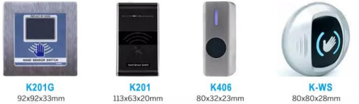
K201G K201 92x92x33mm 113x63x20mm K406 K-WS 80x32x23mm 80x80x28mm