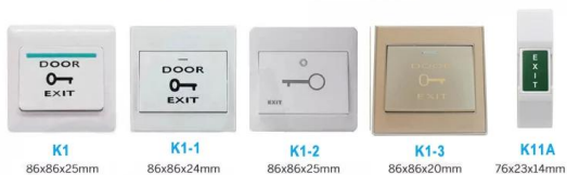
K1 K1-1 K1-2 K1-3 K11A 86x86x25mm 86x86x24mm 86x86x25mm 86x86x20mm 76x23x14mm