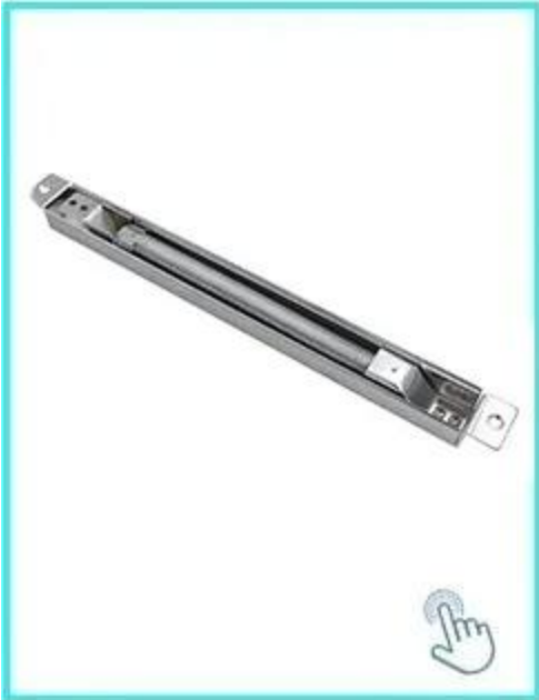
Door ring for surface mounting