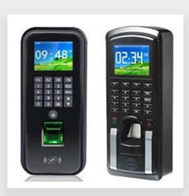
Access Control Reader