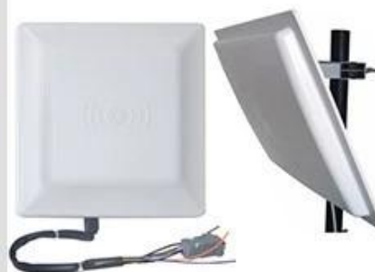
Long Distance UHF Reader