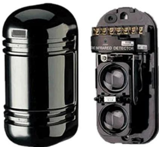
ABT-20 /30 /40 /60 /80 /100