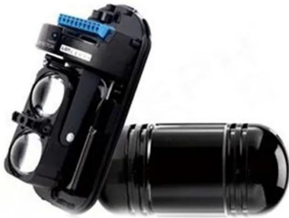
ABT-20 /30 /40 /60 /80 /100