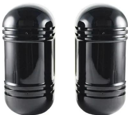
ABT-20 /30 /40 /60 /80 /100