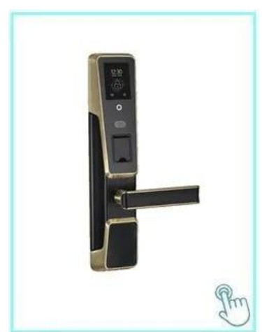
\begin{array}{l} ACM\text{-}5X \\ \\ \text{Biometric fingerprint lock} \end{array}