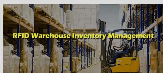
RFID Warehouse Inventory Management