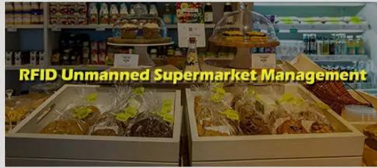
RFID Unmanned Supermarket Management