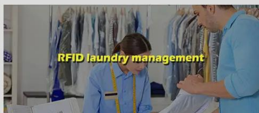
RFID laundry management