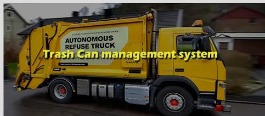
Trash Can management system