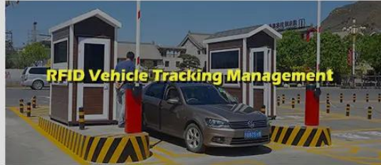
RFID Vehicle Tracking Management