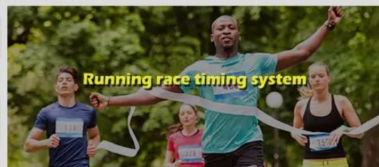
Running race timing system