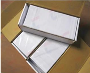
Inner Box Package