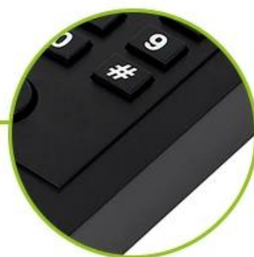
ABS Plastic Material