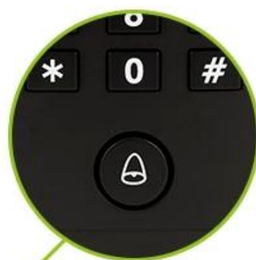
Doorbell button, external doorbell speaker