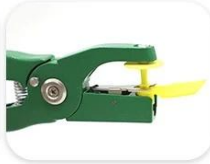
Put in matching earrings