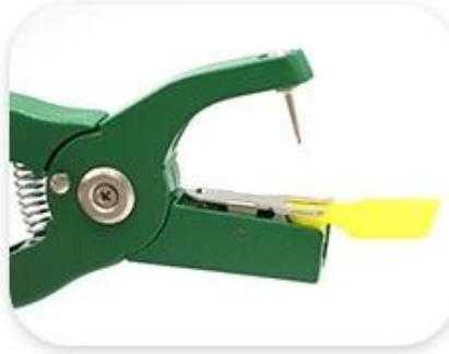
Fix ear tag