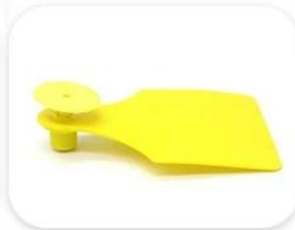
Finish the process