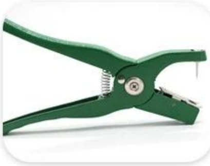
Prepare ear tag pliers