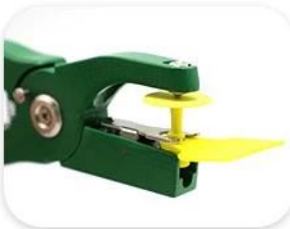
Check alignment holes