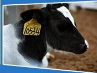
Product application scope