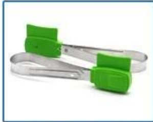
Metal Strap Seal