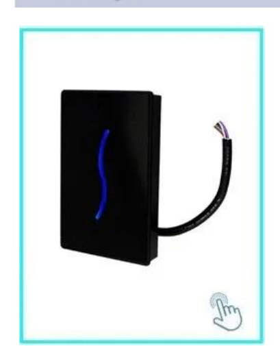
ACM-26X 125Khz EM Card RFID Reader Size: 115mm×75.5mm×16.8mm