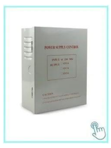
ACM-Y806-3A Backup Power Supply 12V/3A