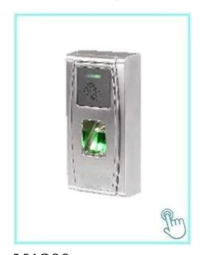
\begin{array}{l} \textbf{MA300} \\ \textbf{Waterproof metal time attendance} \end{array}