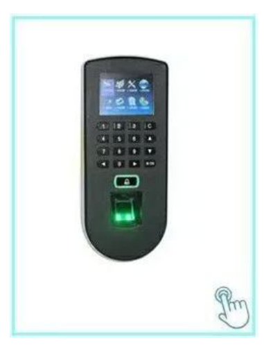
F19 ZK fingerprint time attendance