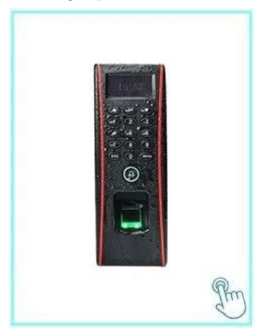
TF1700 Waterproof fingerprint time attendance