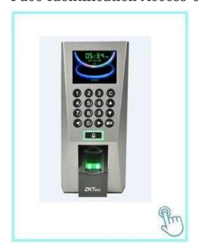
F18 Standalone Fingerprint Access Control