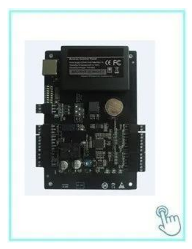
\begin{array}{l} \textbf{C3-100/200/400} \\ \textbf{Access control panel for 1/2/4 doors} \end{array}