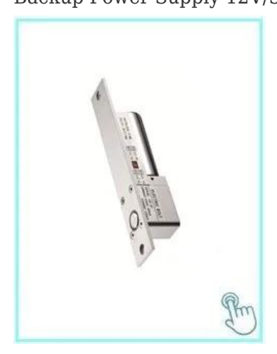
ACM-Y100S Deadbolt lock for door