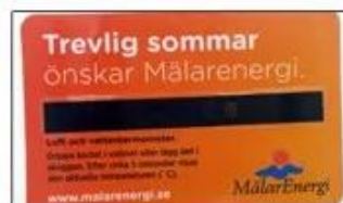
Temperature test panel