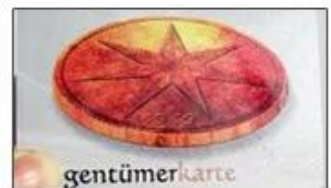
Gold/silver metallic coating