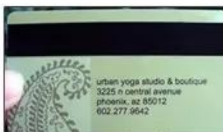
Hico loco magnetic stripe