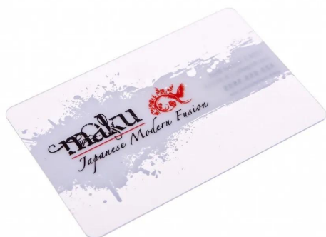
PVC Invitation Card