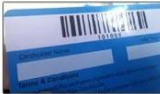
DOD UV barcode