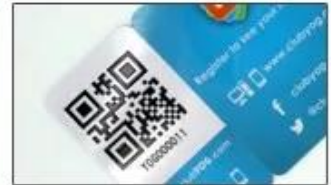
Variable QR code