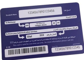
PVC Gift Card