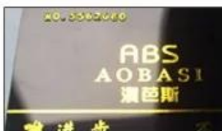
Gold silver hot stamp