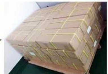
well packed cartons