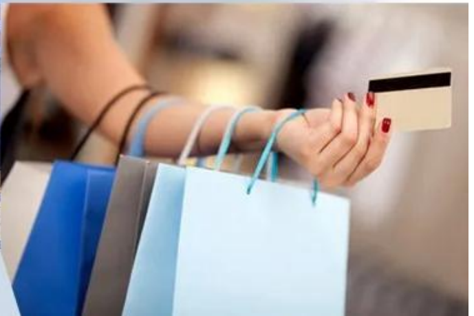
Magnetic Stripe Card