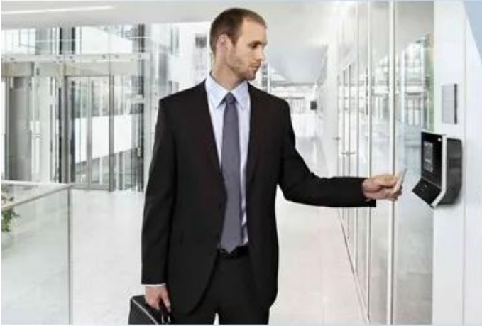
Access Control System