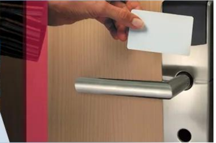
Hotel Card Application