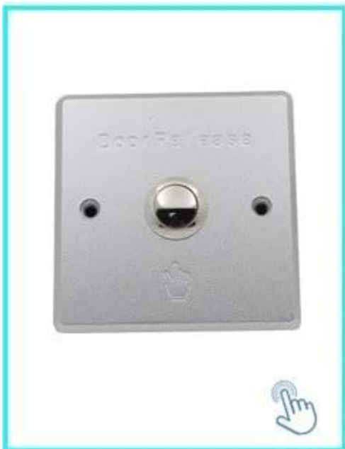
Door Release Button , (Stainless Steel, NO/NC)K5B: 86*86mm