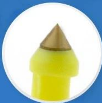
Pure copper earrings