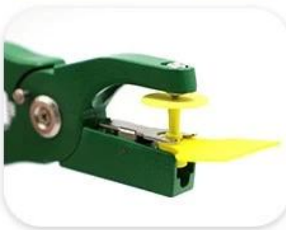
Check alignment holes