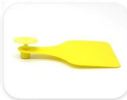
Finish the process