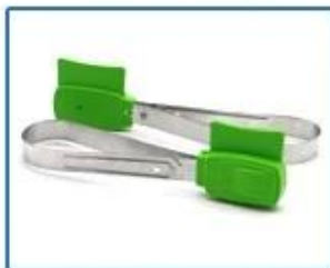
Metal Strap Seal