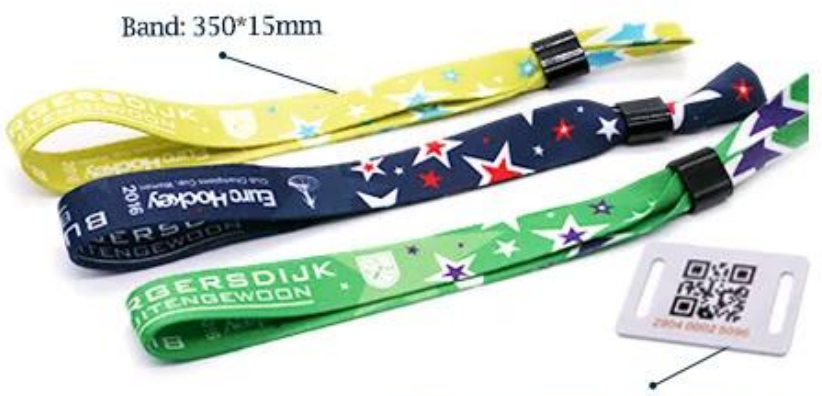
PVC tag: 42*26mm /40*25mm /36*25mm.