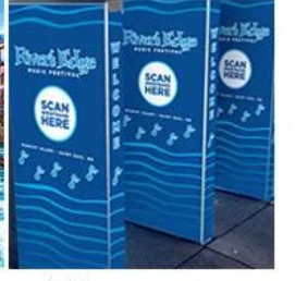
Exhibition & Conference