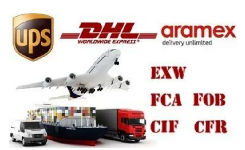
Shipping Way (Just for new customers reference )

We are one of the leading exporter of RFID products in China since 2000 years . With rich international trade experience we know the international shipping very well , We know which express or air/sea line is cheap and safe to your country . We can supply various certificate for you to clean your custom to such as CO , FTA , Form F , Form E ...Ect .