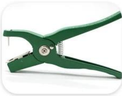
Prepare ear tag pliers