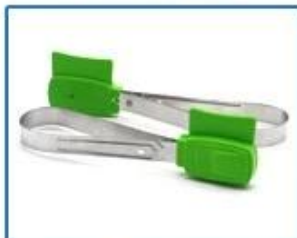
Metal Strap Seal