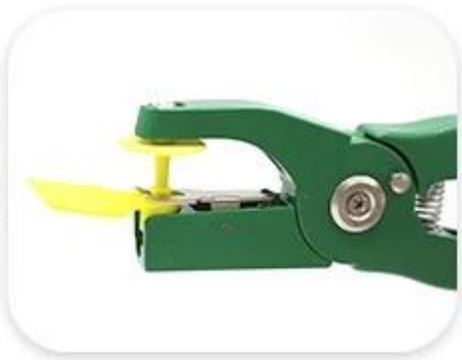
Put in matching earrings