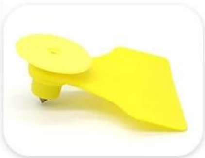
Finish the process