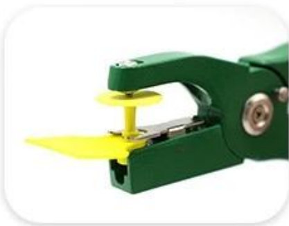
Check alignment holes