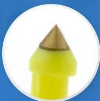
Pure copper earrings