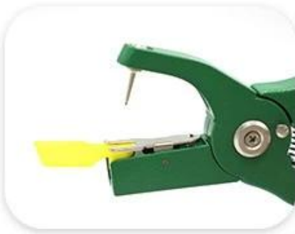
Fix ear tag