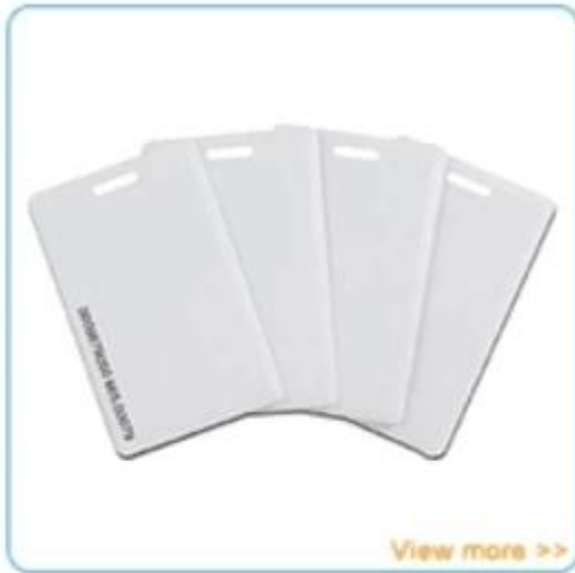
Access control card