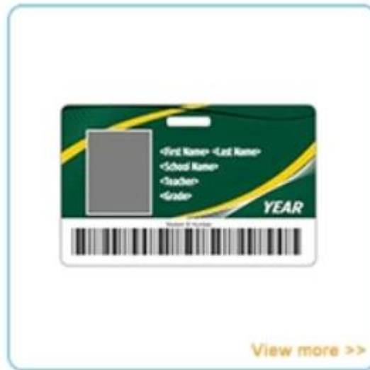
School ID card