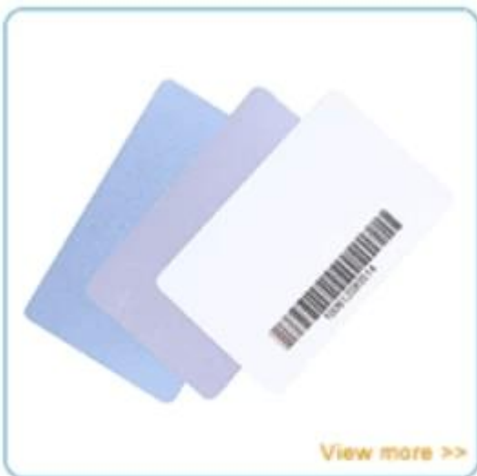
PVC ID card