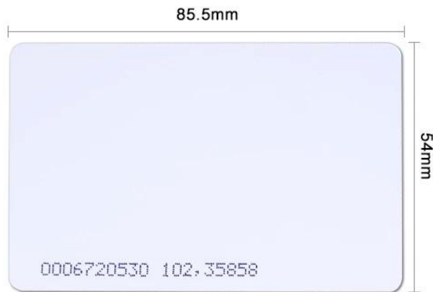
Standard Card Size