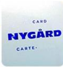
SILK Screen Printing