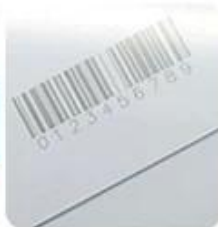
Laser Barcode & QR Code