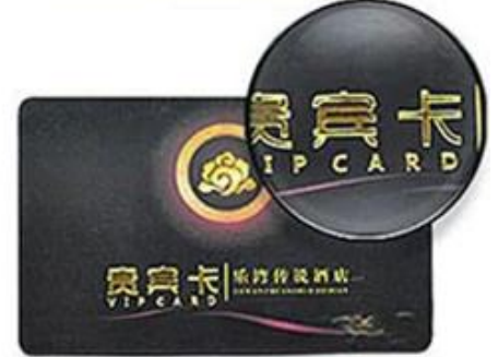
Hot Gold Lettering

We are Producing different RFID Smart Card with different code number