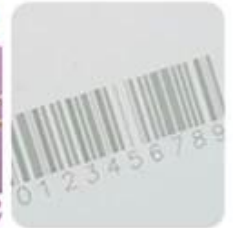
UV Engrave Printing