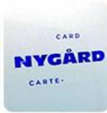
SILK Screen Printing