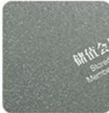
Matt surface (Rough Matt)