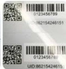
DOD Barcode & QR Code