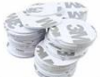
ID/IC Dia 25mm