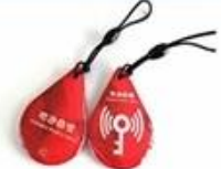
F08 Tag 30*45mm