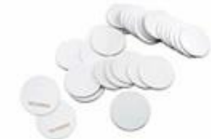
NFC Tag NTG215 25MM