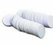
ID/IC Coin Tag Dia 30mm