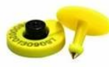
Cattle Animal Ear Tag