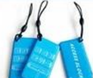
UID Tag 50*30MM