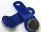
RW 1990A Tag