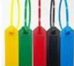
RFID Cable Tie Tag