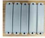
Anti-metal tag 85*20mm