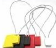
UHF Seal Rfid Tag