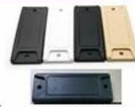
Anti-metal tag 79*30mm