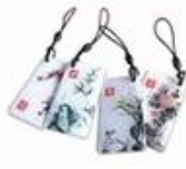
ID/IC Epoxy Tag