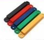
Anti-metal tag 135*21mm