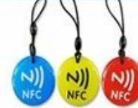
NFC NTAG213 Tag