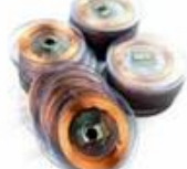
ID/IC Tag Dia25mm