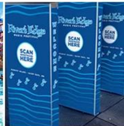
Exhibition & Conference