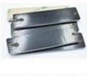
PCB Metal tag 50*10mm