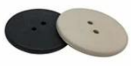
Laundry Washable RFID Tag