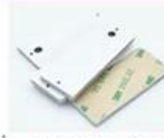
Anti-metal tag 95*25mm