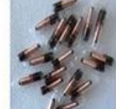
Animal Capsule Glass Tag