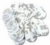
Coin Tag ID/IC 20mm