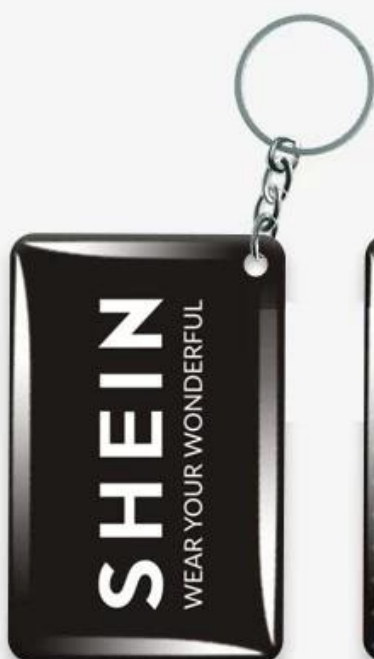
① Iron chain