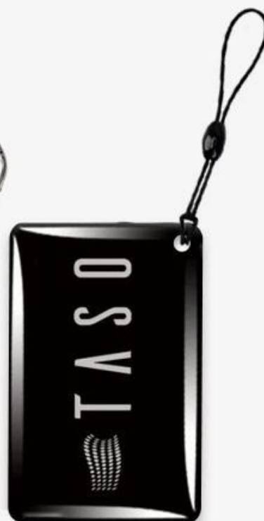
③ Elastic rope