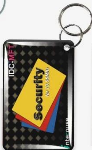
② Iron hoop