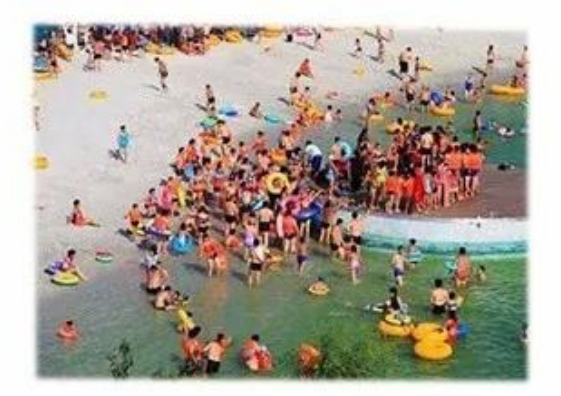
Hot Spring Hotel/Spa