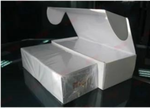
250/200 pcs Cards with Clear Paper