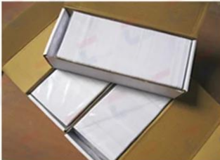
Inner Box Package