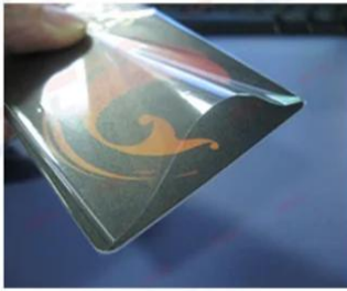
OPP Bag for Individual Card