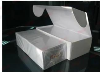
250/200 pcs Cards with Clear Paper