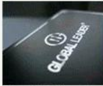
Sliver Hot Stamping