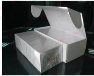
250/200 pcs Cards with Clear Paper