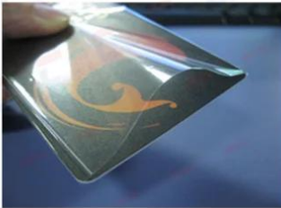
OPP Bag for Individual Card