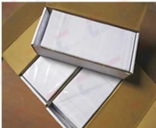
Inner Box Package