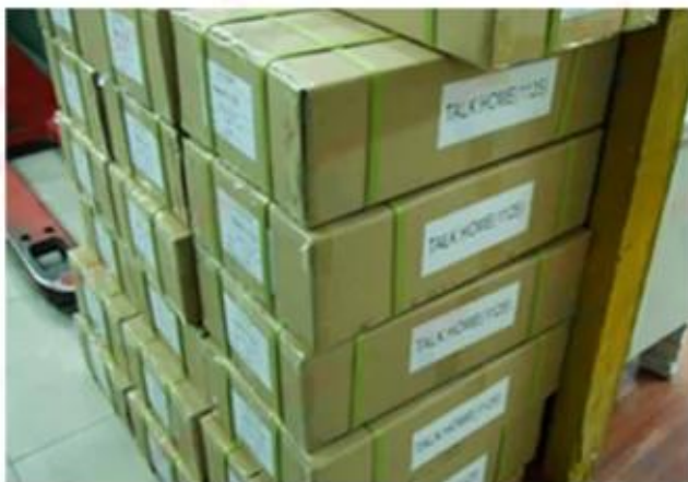
Outside Carton Package