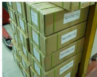
Outside Carton Package