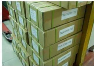
Outside Carton Package