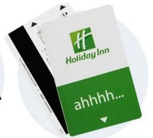
Magnetic Stripe Cards