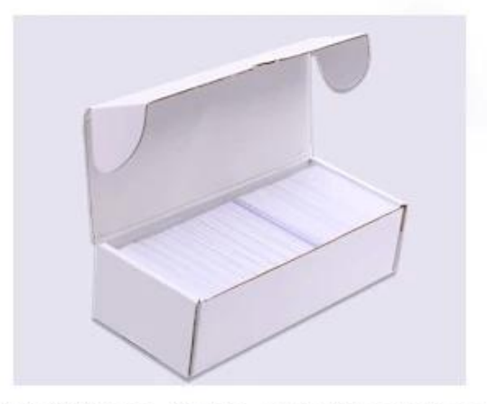
250/200pcs Cards with Clear Paper