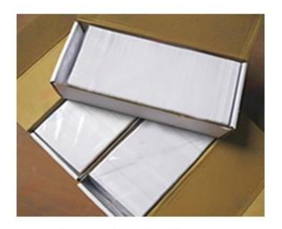
Inner Box Package