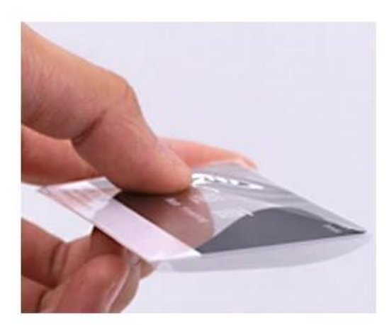
OPP Bag for individual Card