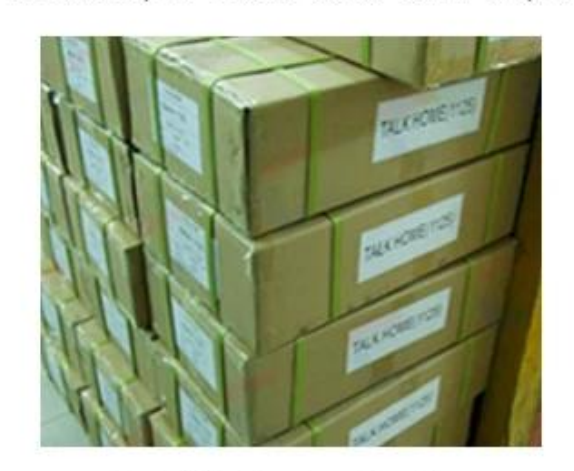
Outside Carton Package