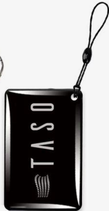
③ Elastic rope