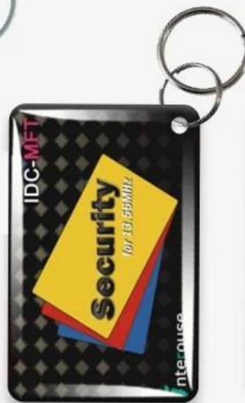
② Iron hoop