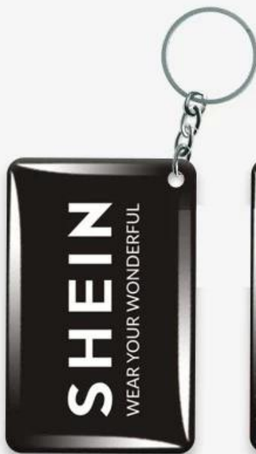
① Iron chain