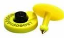
Cattle Animal Ear Tag