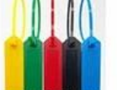
RFID Cable Tie Tag