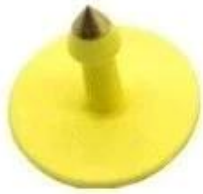
Rfid ear tag