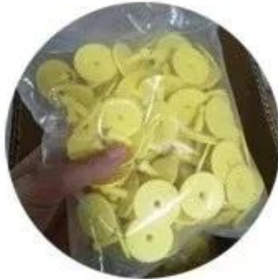
100pcs per bag