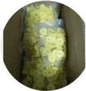
1000pcs per carton