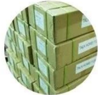
Outer carton package