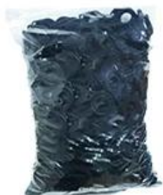
1. Plastic Checkpoint: 500pcs/poly bag