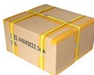
2. Button Card: 100pcs/box 5000pcs/carton