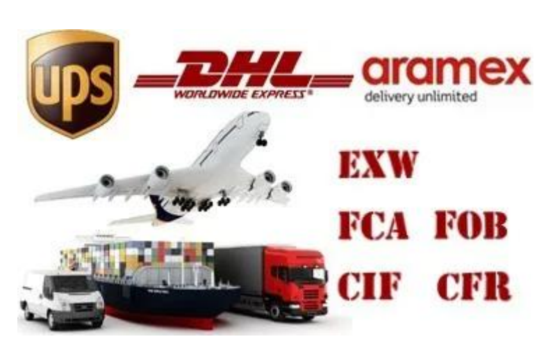
Shipping Way (Just for new customers reference )

We are one of the leading exporter of RFID products in China since 2000 years . With rich international trade experience we know the \frac{1}{2}