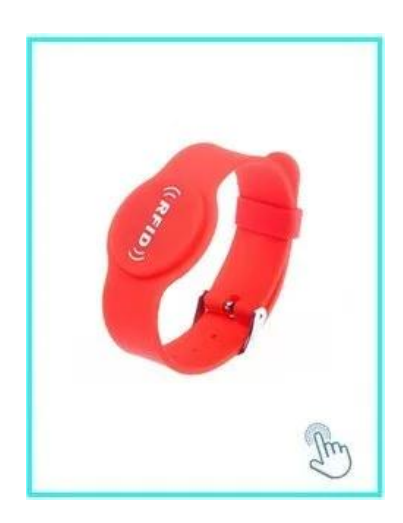
ACM-SW01 Rfid bluetooth smart wristband