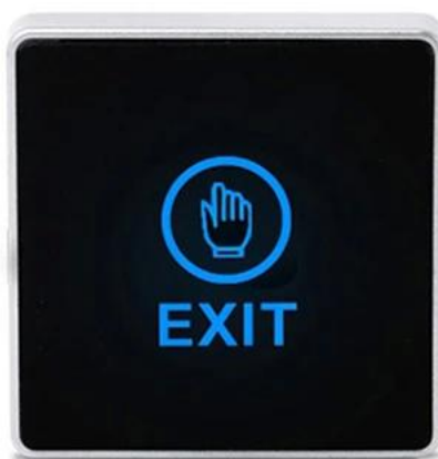
Power on status