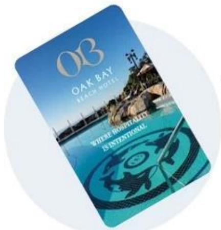
Hotel Key Card