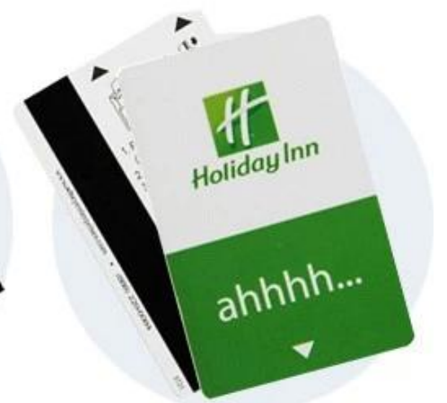
Magnetic Stripe Cards