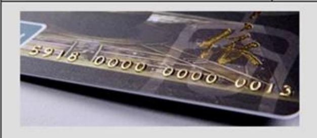
Embossed numbering (Golden)