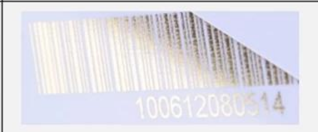
Flat numbering (golden)