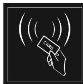
ID EM Cards