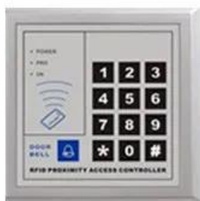
access control system