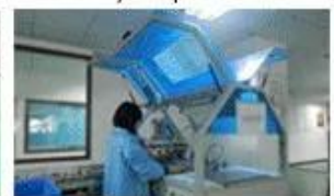
ISO RFID card punching machine