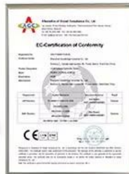
CE Certificate for ACM Access Control Board