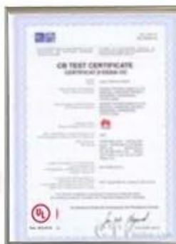
UL Certificate for Locks