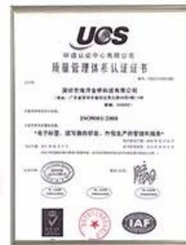
UCS Quality Certificate for RFID Cards rfid reader