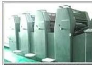
Four colors offset printer