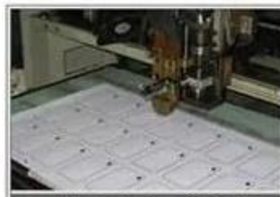
Contactless card inlay