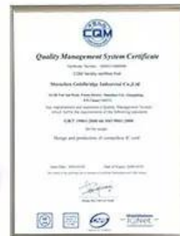
ISO Certificate of RFID Manufacturer