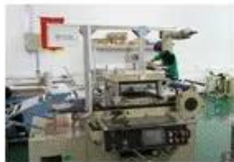
RFID tag&sticker die cut machine