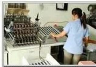
Magnetic stripe machine