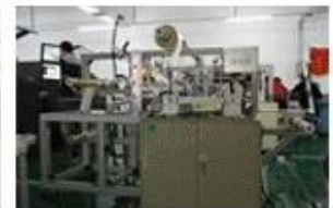
RFID inlay compound machine