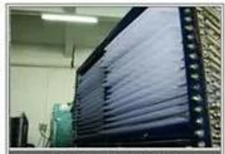
Silk screen printing