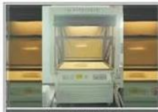
Film plate making