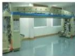
RFID antenna compound machine