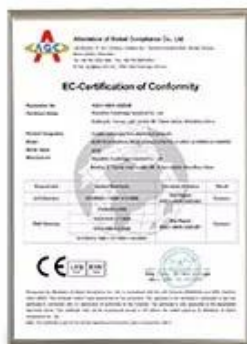
CE Fingerprints Access Control