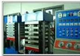
Hot & cool lamination machine