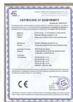
CE - RFID Readers