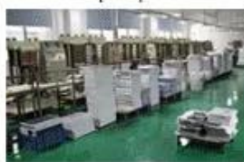
RFID card compound machine