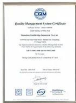
ISO90001 Certificate FOR COMPANY