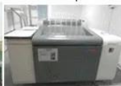
CTP printing plate-maker