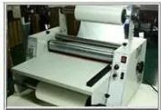
Protective film machine