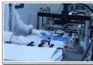
Die cutting punching machine