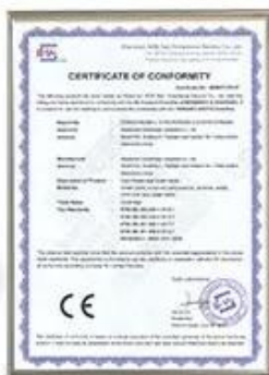
CE RFID smart cards