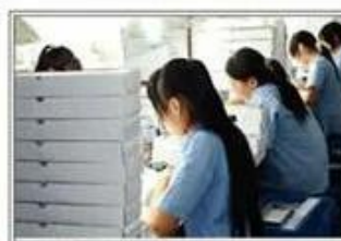
Quality check process