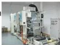
RFID antenna printer