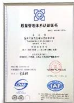
Certificate for manufacturer of RFID Cards