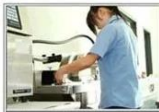
Inkjet printing machine