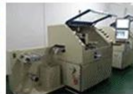
RFID flip-chip machine