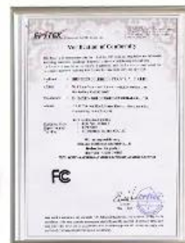
FCC fingerprint access control