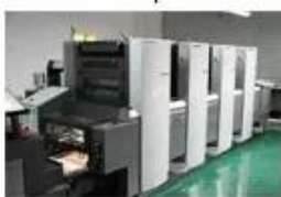
Germany Heidelberg four-color off set printer