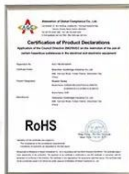
RoHS RFID Reader