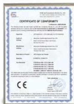
CE UHF Long Range Reader