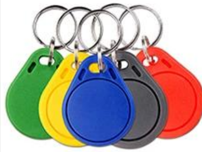
RFID Key fob