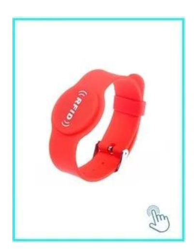
ACM-SW01 Rfid bluetooth smart wristband