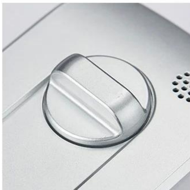
Indoor spin button