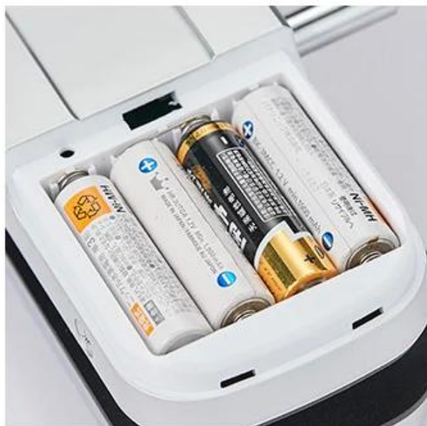
Low battery alarm