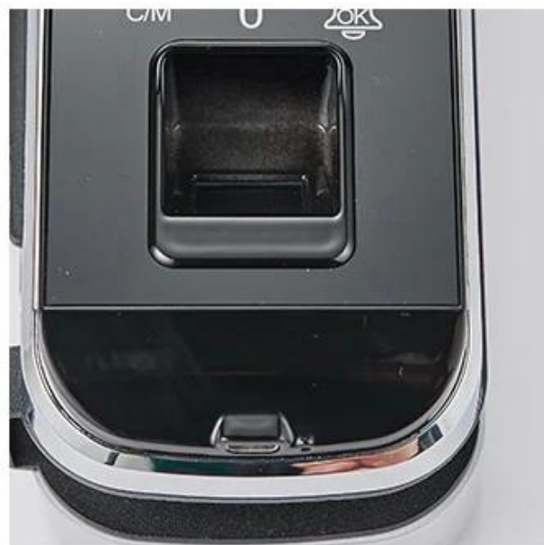
USB emergency door opening