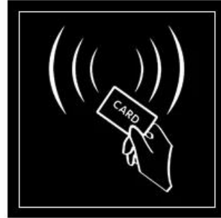
ID EM Cards