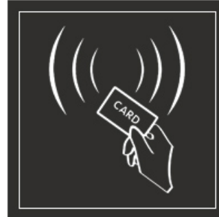
ID EM Cards