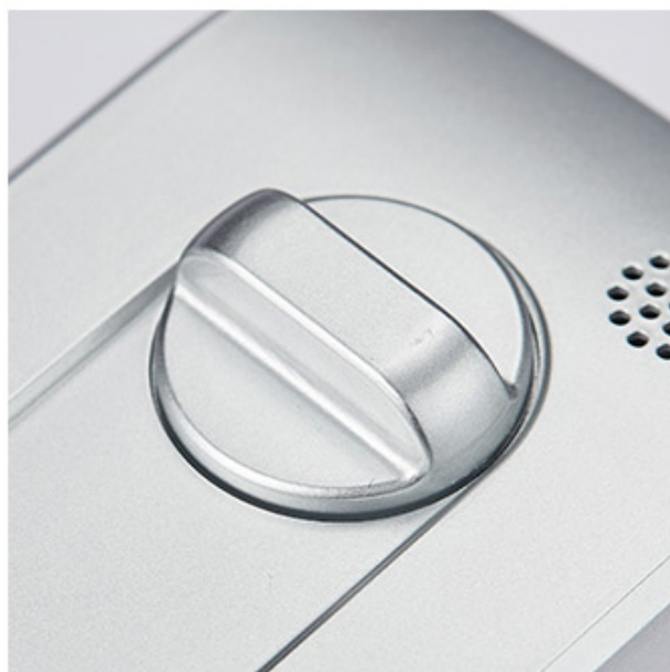
Indoor spin button