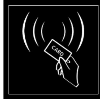
ID EM Cards