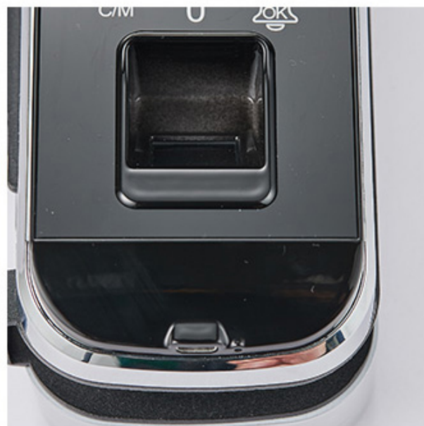
USB emergency door opening