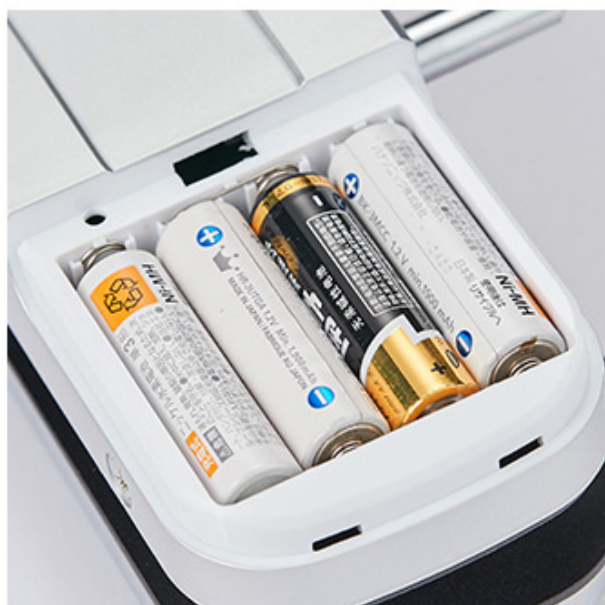
Low battery alarm