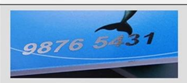
Silver flat code