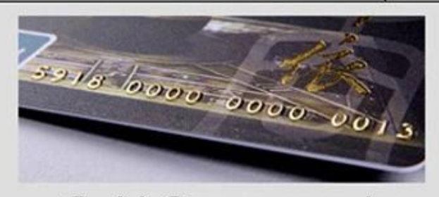
Gold Convex code