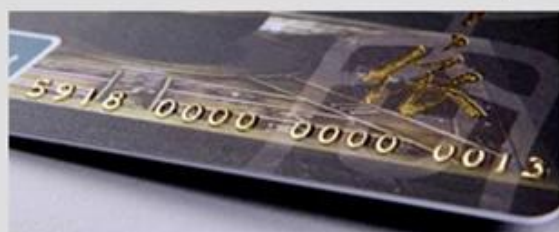
Embossed numbering (Golden)