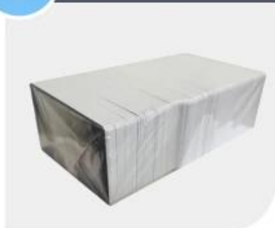
01 Shrinkwrap cards