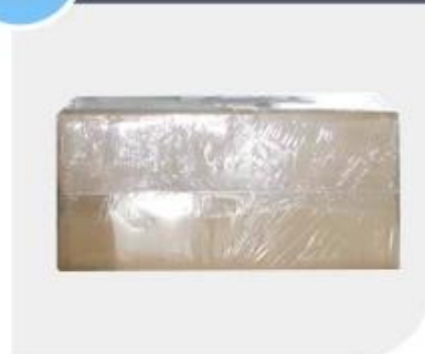
03 Shrinkwrap carton