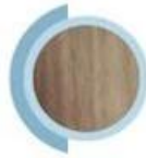
Black Walnut Wood