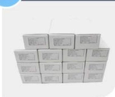
02 White box pack