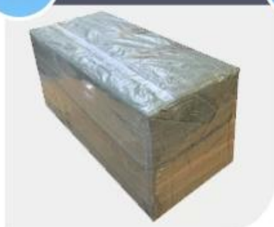
04 Water-proof plastic bag