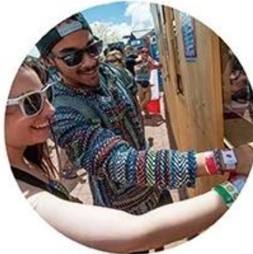
Social Media Sharing