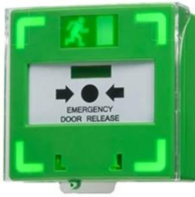
EB-20G (Without LED)